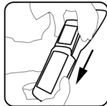
Put your cell phone in the main pocket, then shut the flap down.