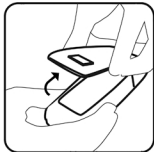
Open the case.