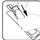
Push the phone into the full insulation pocket following the fabric guide.