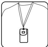
The anti-radiation fabric efficiently protects you against the electromagnetic waves emitted by your cell phone.