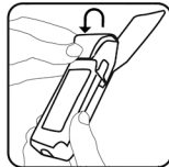
Make sure you shut up the inside flap the right way to completely avoid any incoming waves.

Your cell will be automatically disconnected from the network and won't ring, and the incoming calls will be automatically forwarded to your voice messaging system. You don't need to switch your cell phone off and on to use it anymore. Whenever you need your phone, just take it out from the insulation pocket to be quickly reconnected to the network (up to 10 or 20 seconds depending on your cell version).