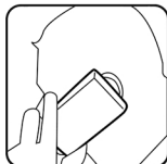
Then you can have a safe phone call.

ISOPHONE provides perfect communication both for incoming and outgoing calls. Moreover, it allows you to have an extended use of your phone without submitting your brain to the cellular warming-up due to the harmful electromagnetic radiations.