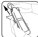
Just pull the guide to take the phone out from the full insulation pocket.

Your cell will be automatically disconnected from the network and won't ring, and the incoming calls will be automatically forwarded to your voice messaging system. You don't need to switch your cell phone off and on to use it anymore. Whenever you need your phone, just take it out from the insulation pocket to be quickly reconnected to the network (up to 10 or 20 seconds depending on your cell version).